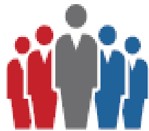
Cooperatives (manufacturing, housing, consumer)