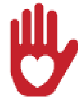
Civil society organisations, non-profit organisations, foundations