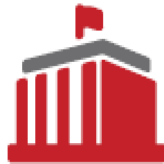
Organisational units of central government, state enterprises, state organisations