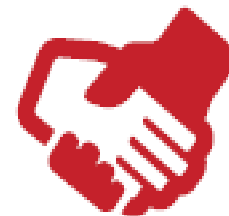
Social partners (trade unions, sector associations, employer associations, chambers of commerce and industry)