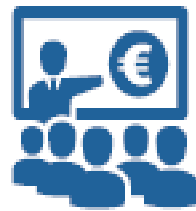
Business support organisations