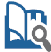
Public and private education and research institutions